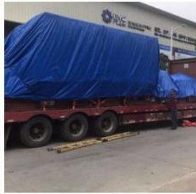
2. Special logistics packaging