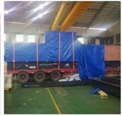
3. Suitable carton size