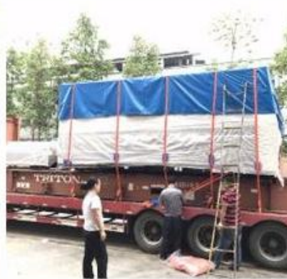
5. Professional placement