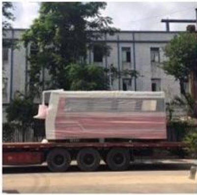
1. Shock bubble film