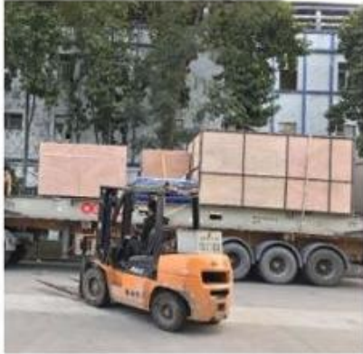
4. Complete package